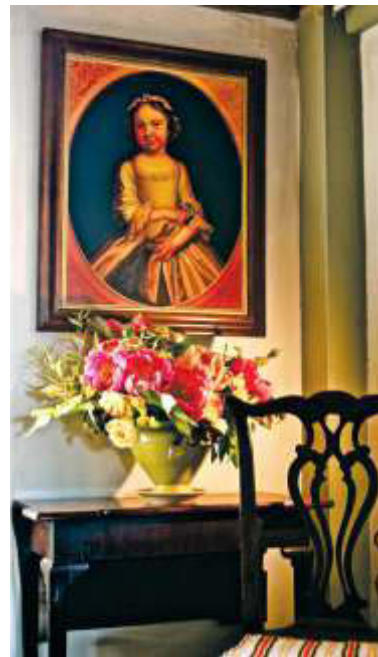
Beauty is everywhere in Annapolis Royal, from the stalls of its Farmers' Market to the homes of its citizens.

If you love design – houses, gardens, art, crafts, antiques, vintage and modern creations – you will love Annapolis Royal! The area is more than Canada's birthplace...it is a centre for the design arts...a unique design destination. Annapolis Royal and its surrounding townships are home to countless artists and designers who have moved here from other parts of Canada, the United States and Europe. They have joined the growing concentration of local artists and specialized craft and trades people in an area recognized for its beauty, quality of life, sustainable lifestyle and historic connections with the wider world.