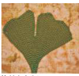
Multiple Artists THE COURTYARD