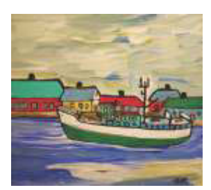
Ed "Tripp" Parmiter TRIPP'S GALLERY