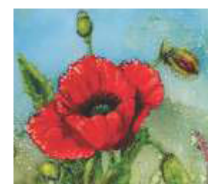
Multiple Artists BLUE MIND GALLERY

To meet some of these talented artists in THE COURTYARD person and visit their colourful studios and galleries are special area highlights.