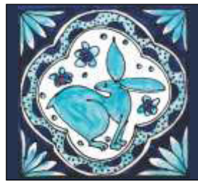
Multiple Artists LUCKY RABBIT & CO