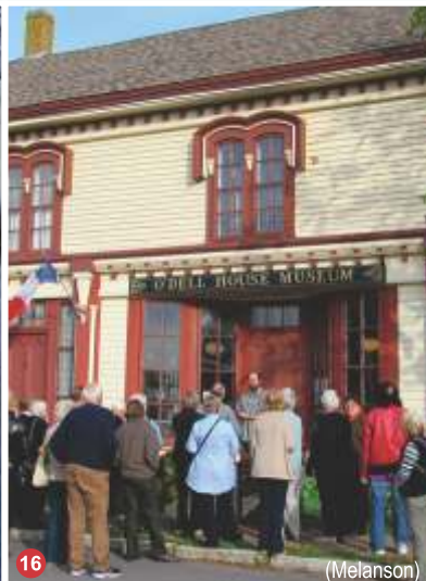
16 O'Dell House Museum (Melanson)