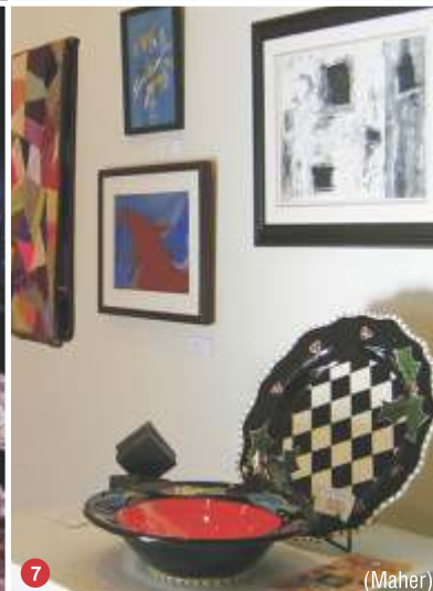
7 ARTSPPLACE (Maher)