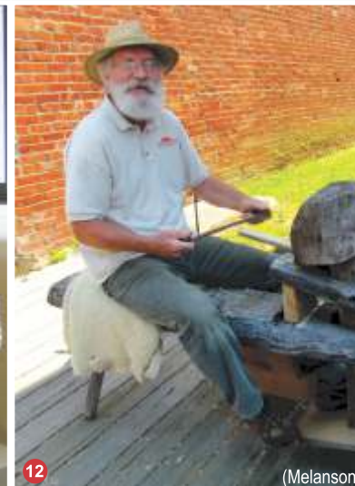
12 Sinclair Inn Museum (Melanson)