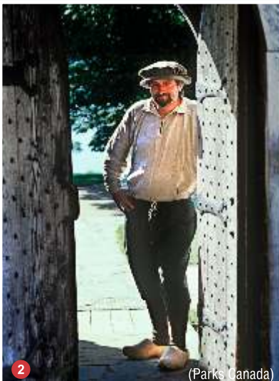
2 Port-Royal Habitation NHS (Parks Canada)