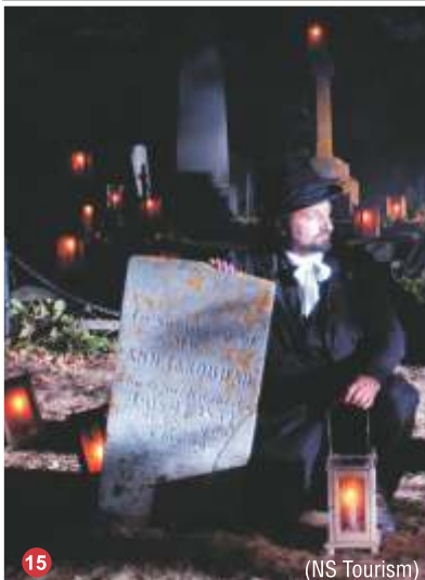
15 Candlelight Graveyard Tours (NS Tourism)