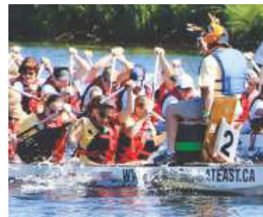
Annapolis River Festival