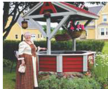
House & Garden Tour